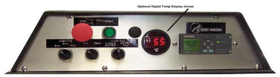
Front View of Control Panel

Medical Equipment Washing & Decontamination Systems